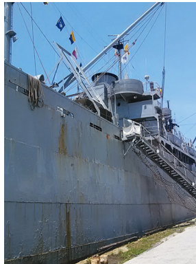
S.S. John W. Brown