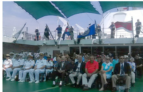
The Quarterdeck Crowd

The focus this year was on the little known but vital role played by the Commissioned Corps of the United States Public Health Service.