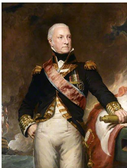
ADM John Jervis, Earl St. Vincent

Johnson despised the 18th Century navy. "Being in a ship," he wrote, "is being in a jail, with the chance of being drowned." Recent research,