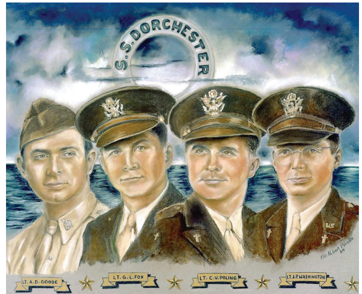
The Four Chaplains