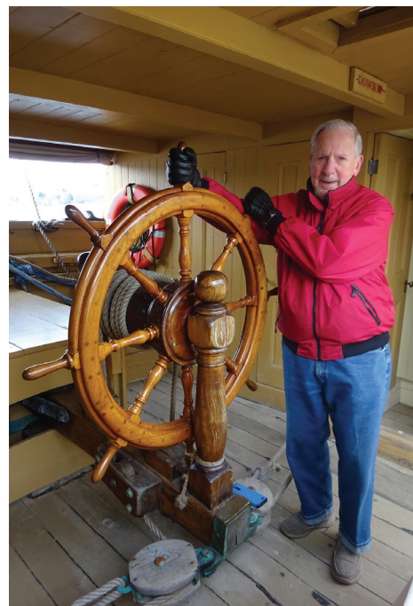
At the helm

The following day we headed north again,