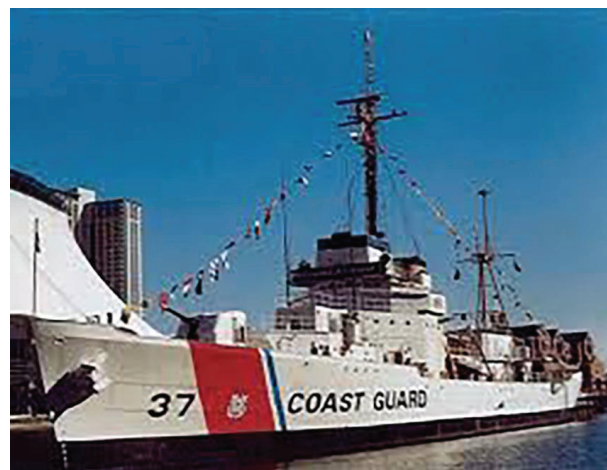
WHEC-37 USCGC Taney