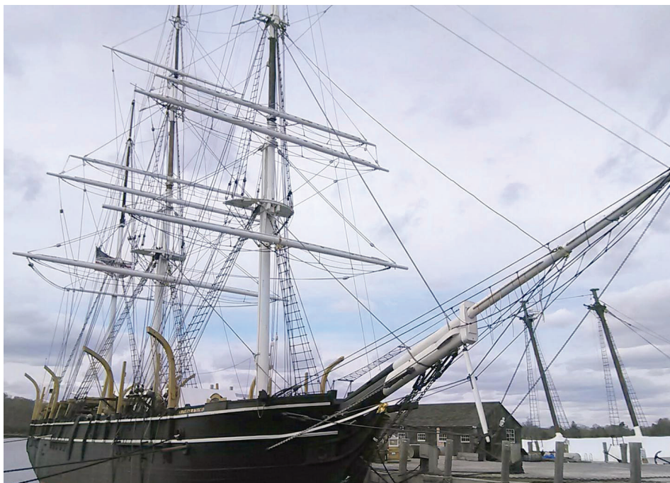
The Charles W. Morgan