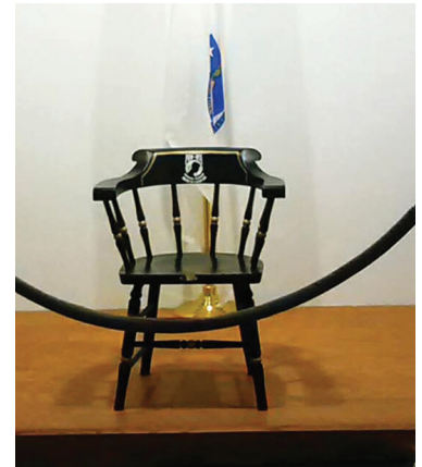
MIA display on Kennedy

the Gearing Class destroyer USS Joseph P. Kennedy, Jr., named for the eldest son of the celebrated clan that gave us a President of the United States and two United States senators. Joe Kennedy was killed during the Second World War while, as you know, two of his brothers died at the hands of assassins years later.