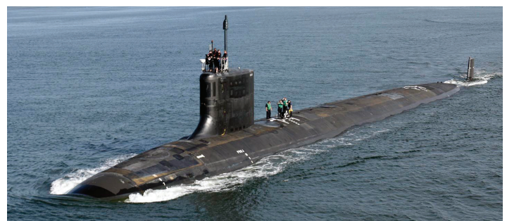
Virginia Class submarine