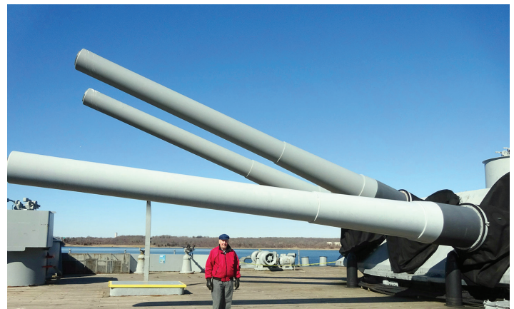
Under Mamie's aft 16" main battery