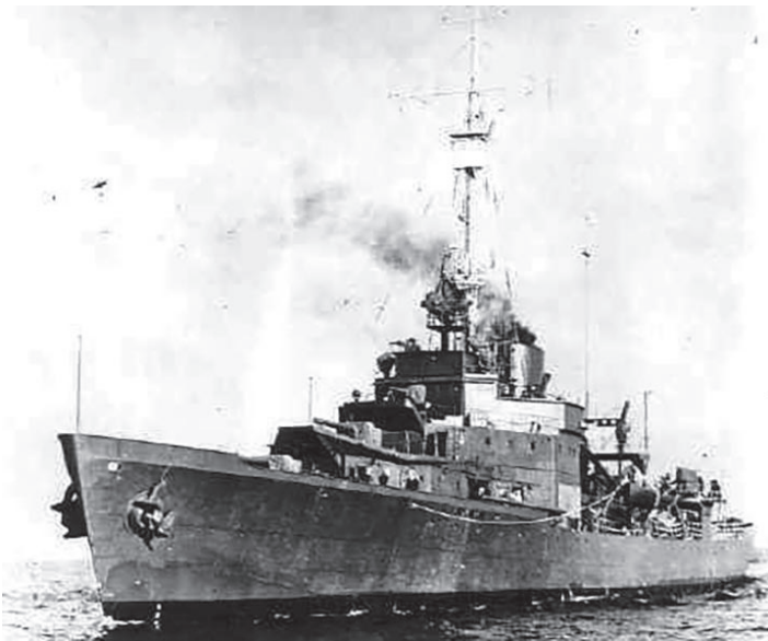
WPG-34 USCGC Alexander Hamilton