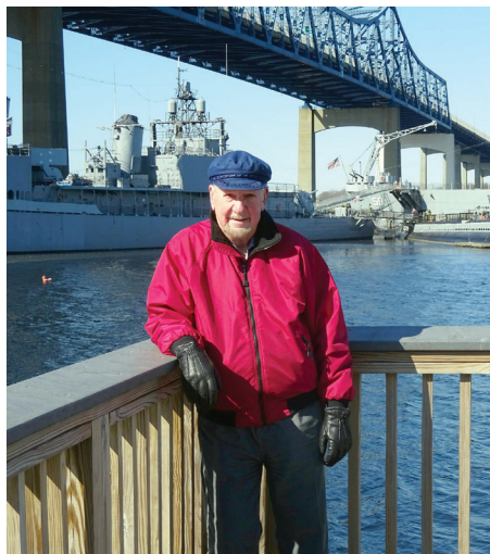
At Battleship Cove

First stop: Mystic, Connecticut, one of the nation's truly great historic seaports. It was a pure delight to wander through the streets of the old town, to visit the ancient shops and homes, to chat with the artisans and historic interpreters. Most of all to climb aboard Mystic's elegant floating centerpiece and, for many decades, Mystic's principal attraction; the whaler Charles W. Morgan. It wasn't the first time I'd been there. But, in the dead of winter, with relatively few other visitors on site, it may have been the most memorable. The only sounds were the brisk wind ghosting through the rigging and the faint echo of our footsteps as we walked the deck, then lay below for a look at Spartan quarters of the crew and the tools that were used to render blubber into oil. It wasn't too difficult to imagine what life must have been like for the dozens of hardy New Englanders who often spent, as described by Richard Henry Dana, "Two Years Before the Mast." And when we returned topside and I took hold of