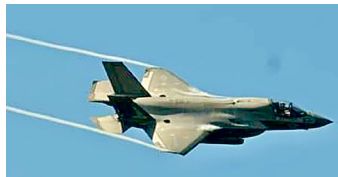
F-35 over the harbor