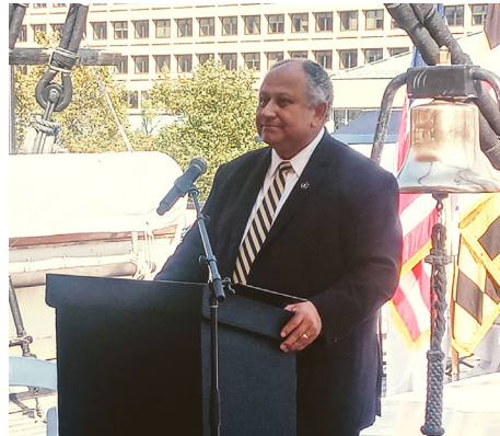
SecNav Del Toro the Liberty Ships and landing craft during WWII.

The speeches were all about history and sea power; the need to project our mastery of the depths of the oceans to friend and foe alike; Baltimore's past as one of the nation's most important seaports and ship building centers. About one of the first frigates, USF Constellation, built for the fledgling United States Navy right here at Fells Point; about