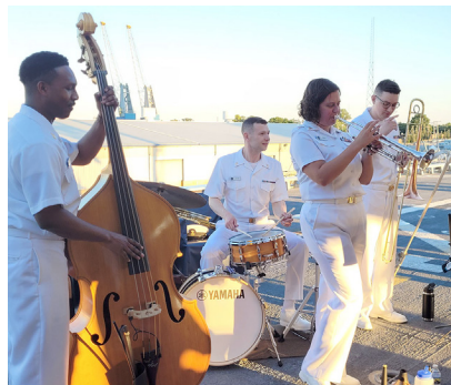
Party time on USS Ft. Lauderdale (LSD-28)