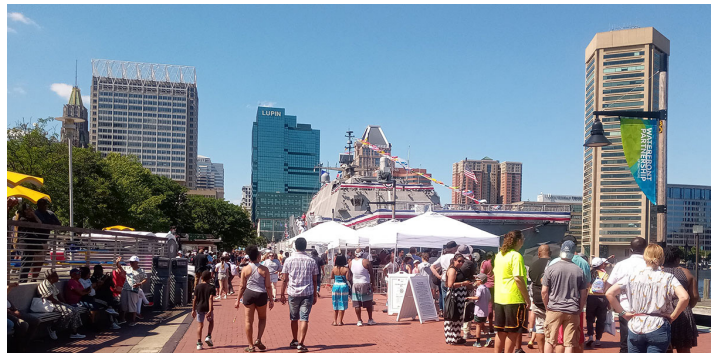
On the Light Street promenade