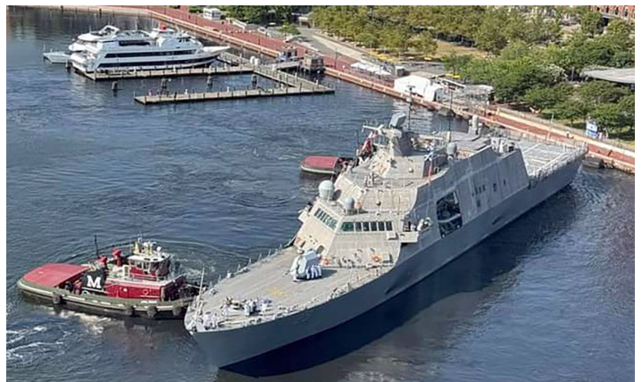
USS Marinette (LCS-25)